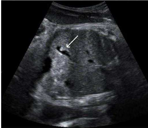
Figure 1 A. Antenatal ultrasound scan showing solitary gall bladder stone