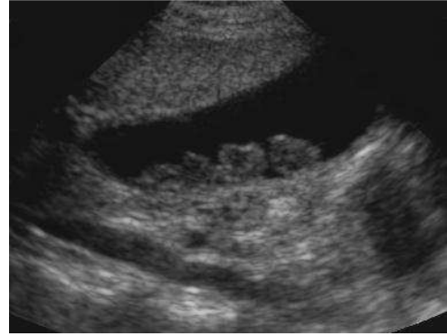
Figure 1 D. Postnatal ultrasound scan showing multiple gall bladder stones.