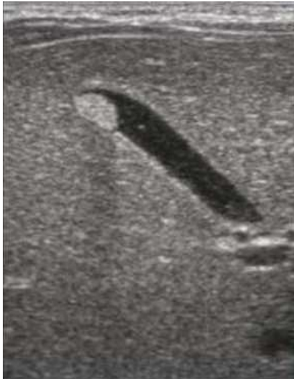
Figure 1 B. Postnatal ultrasound scan showing solitary gall bladder stone